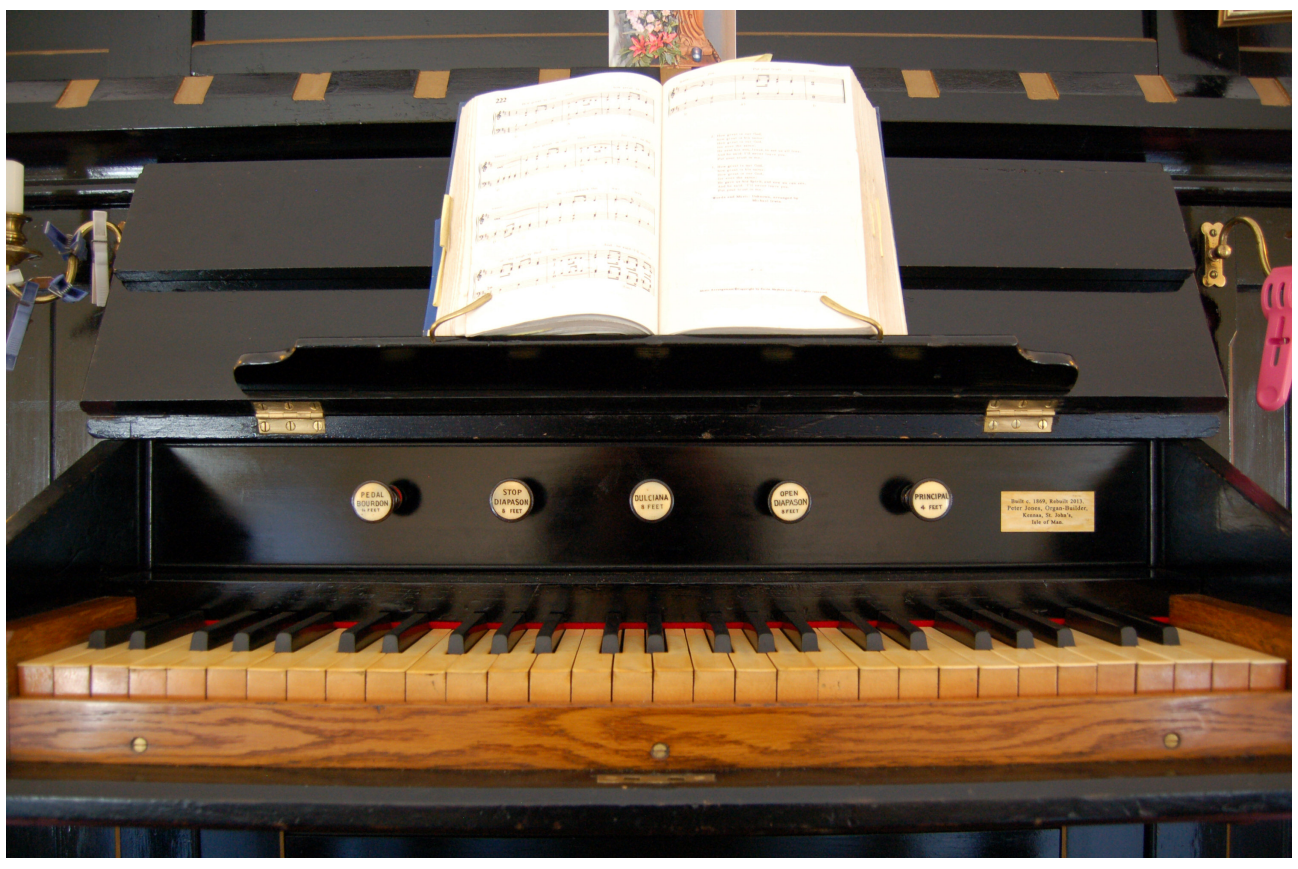
Gt: 8,8,8,4, Ped: 16.

The builder of this tiny instrument is unknown, but whoever it was had a sure sense of style in its outward appearance, and was skilled in the organ-building practices of their day. Originally built without pedals, this may well have been a chamber organ intended